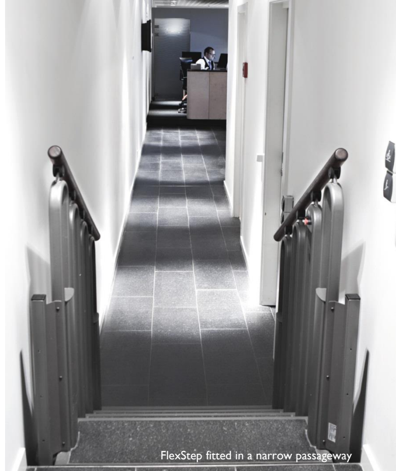
FlexStep fitted in a narrow passageway